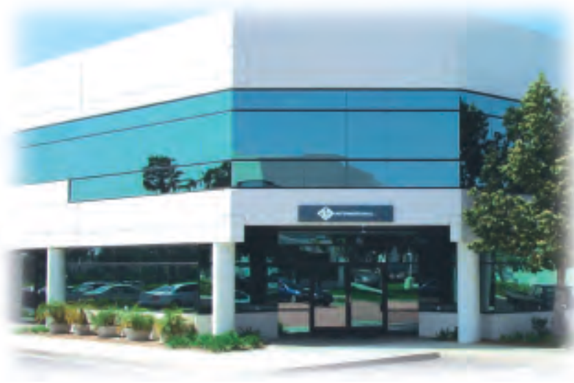
SonarGuard® was developed by RJE Technologies, Inc., headquartered in Irvine, California

Child safety is our number one goal at RJE Technologies. We provide a high quality safety product that is unrivaled and will give homeowners peace of mind, knowing they have installed that most critical layer of defense.